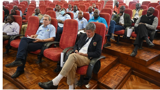
Delegates following the proceedings

He then highlighted the achievements of the previous year saying, "The last year was particularly eventful. We were able to assist many of our members in need, especially bereavement. This is a good spirit and should be encouraged."